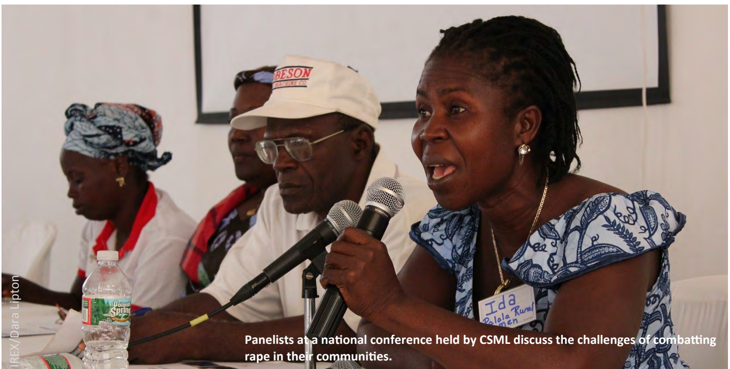
Panelists at a national conference held by CSML discuss the challenges of combatting rape in their communities.

The discussion highlighted huge gaps and led to recommendations for coordination among and between service providers and the community, improved information dissemination, and enhanced capacity in the LNP and the courts. ■