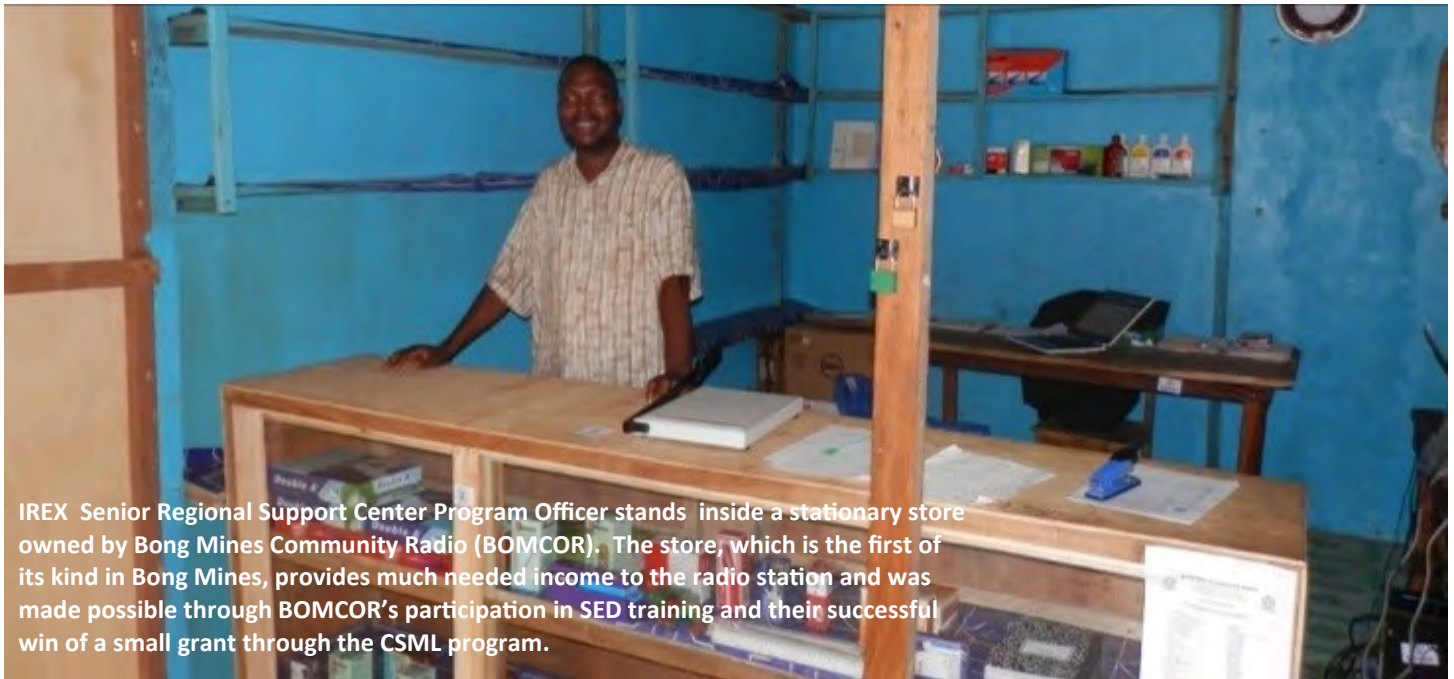
IREX Senior Regional Support Center Program Officer stands inside a stationary store owned by Bong Mines Community Radio (BOMCOR). The store, which is the first of its kind in Bong Mines, provides much needed income to the radio station and was made possible through BOMCOR's participation in SED training and their successful win of a small grant through the CSML program.

Radio Karn of Nimba County received $8,640 in seed money to build the first stationary store in Karnplay, Nimba's second largest town on Liberia's border with Guinea and Ivory Coast. As a result, students don't have to travel long distances to buy school supplies and county officials use the store's photo copying machine to copy official documents. Radio Karn also used some of the funds to build a production studio which provides an additional source of funds as local businesses, government officials, and NGOs pay the studio to record and air messages on their behalf.