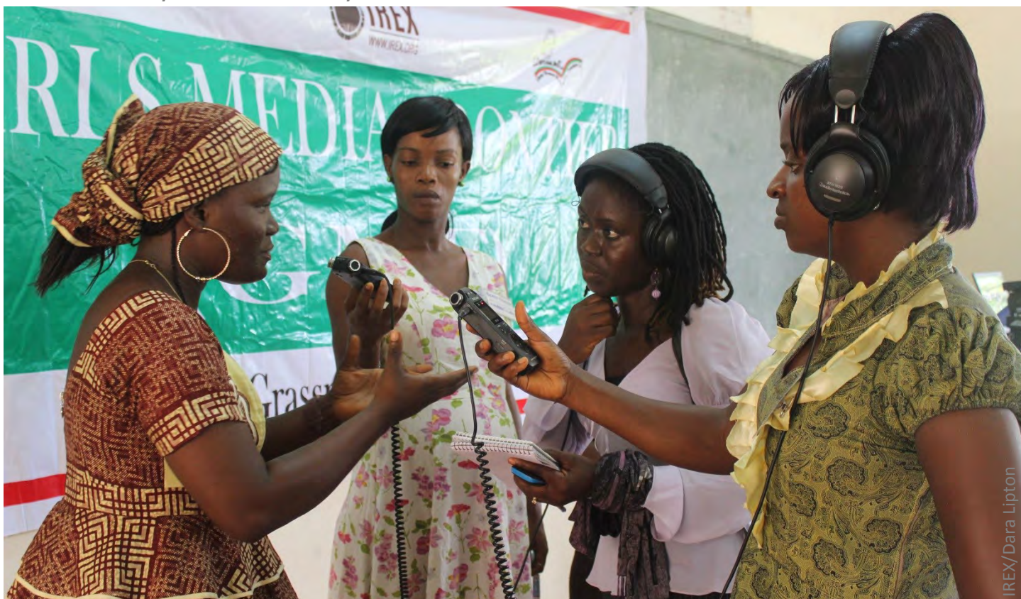
Young women practice their interviewing skills as part of their training for the Girls Media Frontiers (GMF) program. This training prepared 24 young journalists to return to their communities and produce original radio and television content and to tell the stories of how ordinary citizens are effected by the Election.

In another case, a CSO's election day activities put their staff in the right spot for responding successfully to a violent episode. On election day after voting was closed, violence erupted in Weajour Town, Bomi County, among youth partisans of two major parties. Flomo Theatre Production (FTP) staff happened to be on the scene and quickly acted to bring together community leaders and party representatives to discuss the problem: a story was going around that ballot papers were being handled inappropriately. In tracking down the details they learned that someone had walked into the polling station after the election and saw ballot pa-