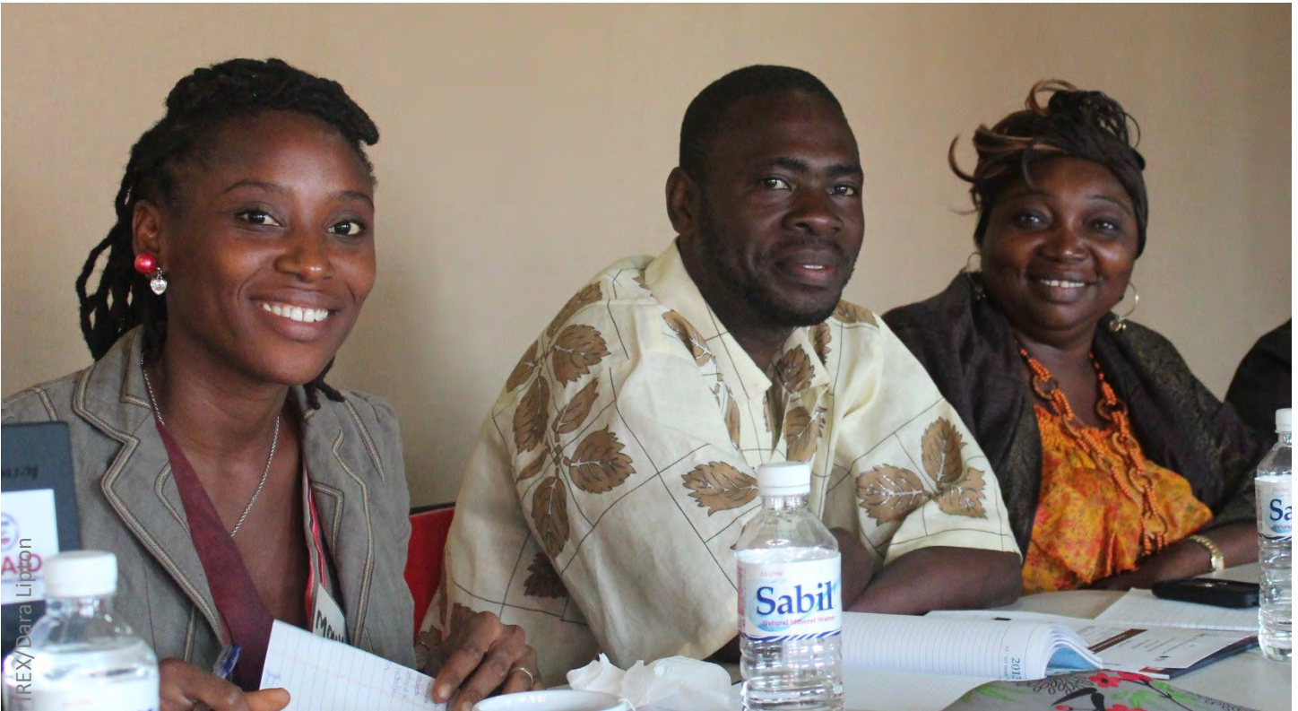
Mentors and Master Trainers from NARDA, WANEP and YMCA ideas and strategize at an Annual Workplanning meeting where they are joined by their fellow Main Partners, IREX, USAID, Social Impact, The Carter Center and other program stakeholders.

ceived and then stepped down to the CSOs, the RPs exclusively received training in mentoring, Fixed Obligation Grants, Communications, Organizational Development, Strategic Planning, Business Planning, and Monitoring and Evaluation. They were also given a CSO Resource Toolkit for mentoring, which they helped to develop, full of planning and policy documents, sample forms for financial and human resource management, and a special section of management documents for more advanced CSOs. Their Executive Directors participated in monthly Leadership Breakfast Meetings held with the heads of CSML's seven Main Partners and IREX staff on a monthly basis to discuss issues and topics related to leadership. In addition, the process of Master Trainers and Mentors receiving