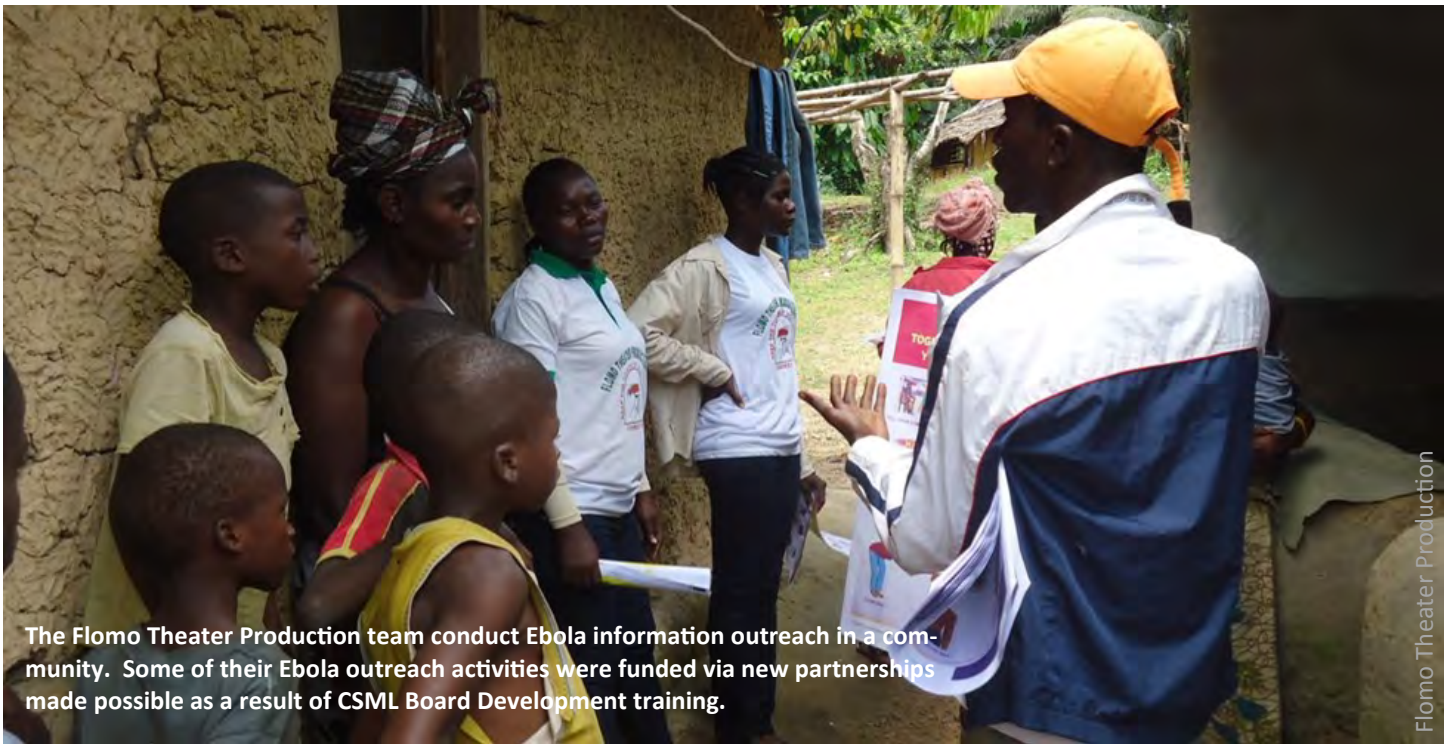
The Flomo Theater Production team conduct Ebola information outreach in a community. Some of their Ebola outreach activities were funded via new partnerships made possible as a result of CSML Board Development training.

included information on the purpose of a board and best practices for identifying and recruiting board members and developing board job descriptions. The document included specific sections for CSOs and CRSs.