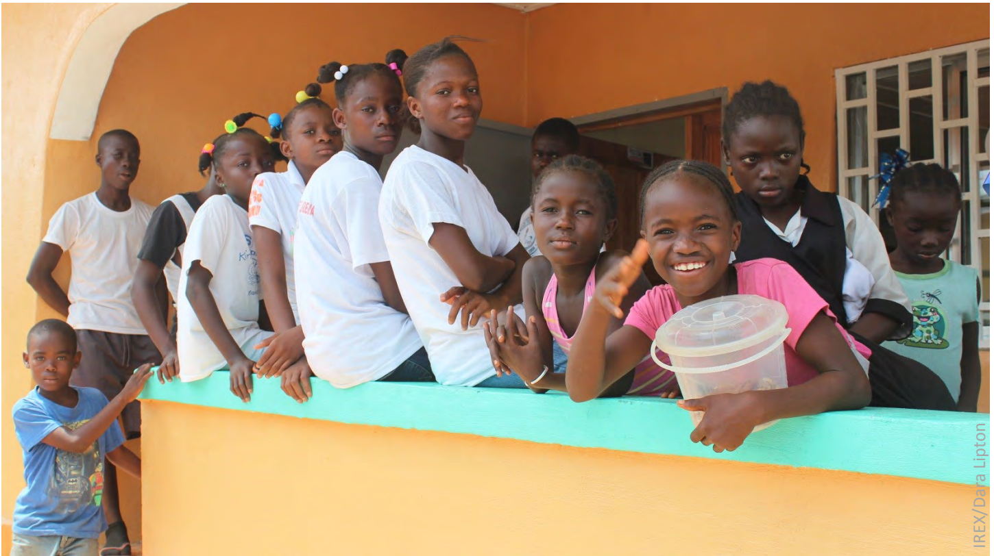
Young girls attend the launch of a women and girls' center in Kamara Town, Montserrado County, which was built by National Empowerment Program for Women and Children (NEP). The Executive Director of NEP credits CSML's Project Cycle Management and Proposal Writing Training for giving her the skills to write this successful proposal.