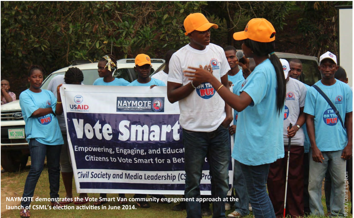
NAYMOTE demonstrates the Vote Smart Van community engagement approach at the launch of CSML's election activities in June 2014.