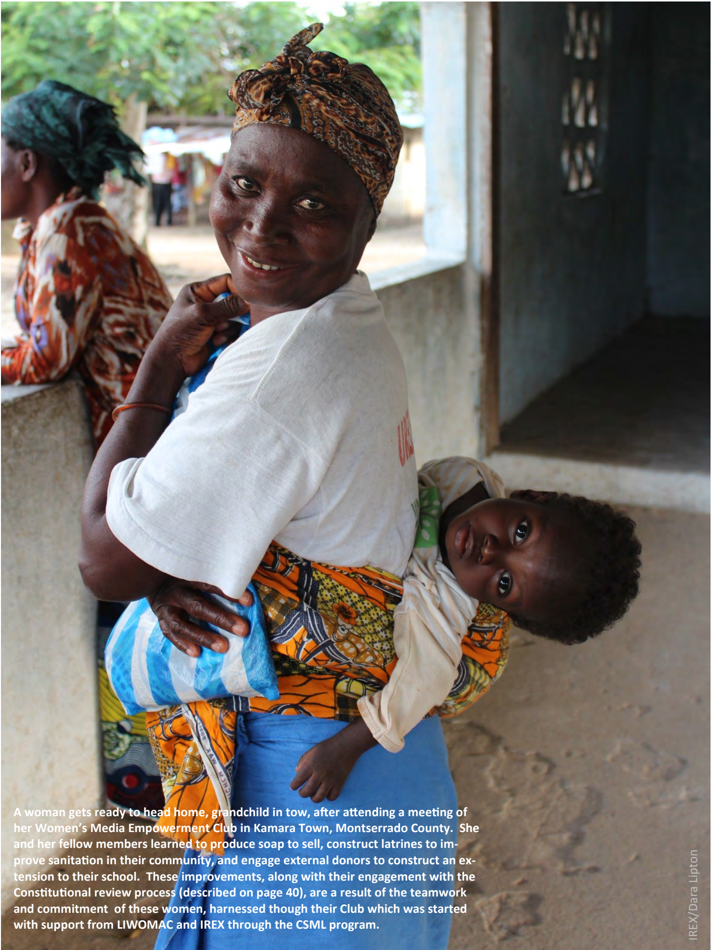
A woman gets ready to head home, grandchild in tow, after attending a meeting of her Women's Media Empowerment Club in Kamara Town, Montserrado County. She and her fellow members learned to produce soap to sell, construct latrines to improve sanitation in their community, and engage external donors to construct an extension to their school. These improvements, along with their engagement with the Constitutional review process (described on page 40), are a result of the teamwork and commitment of these women, harnessed through their Club which was started with support from LIWOMAC and IREX through the CSML program.