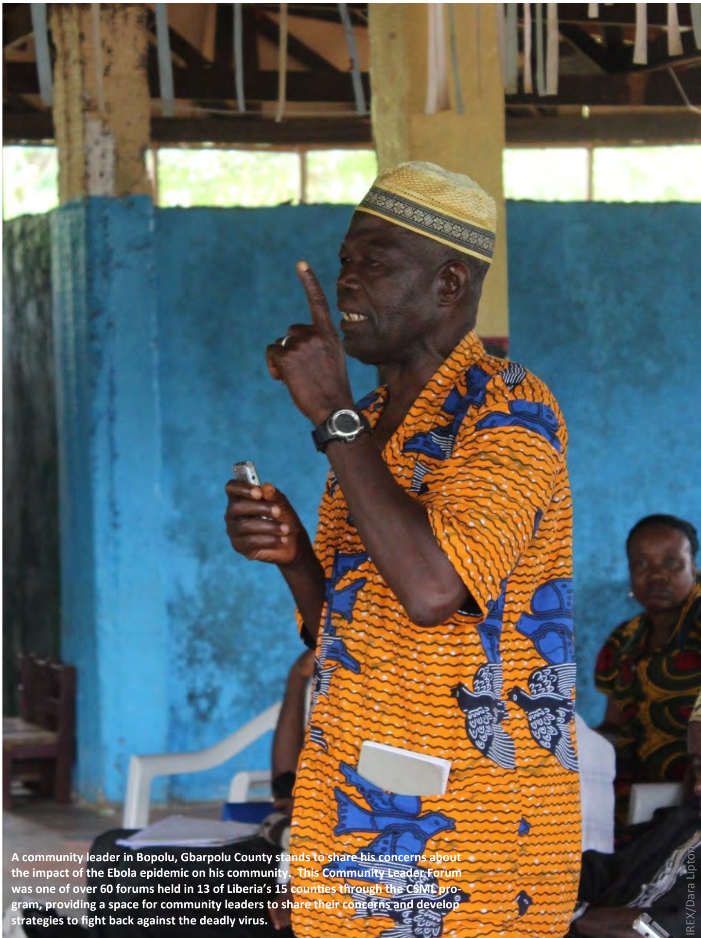
A community leader in Bopolu, Gbarpolu County stands to share his concerns about the impact of the Ebola epidemic on his community. This Community Leader Forum was one of over 60 forums held in 13 of Liberia's 15 counties through the CSML program, providing a space for community leaders to share their concerns and develop strategies to fight back against the deadly virus.