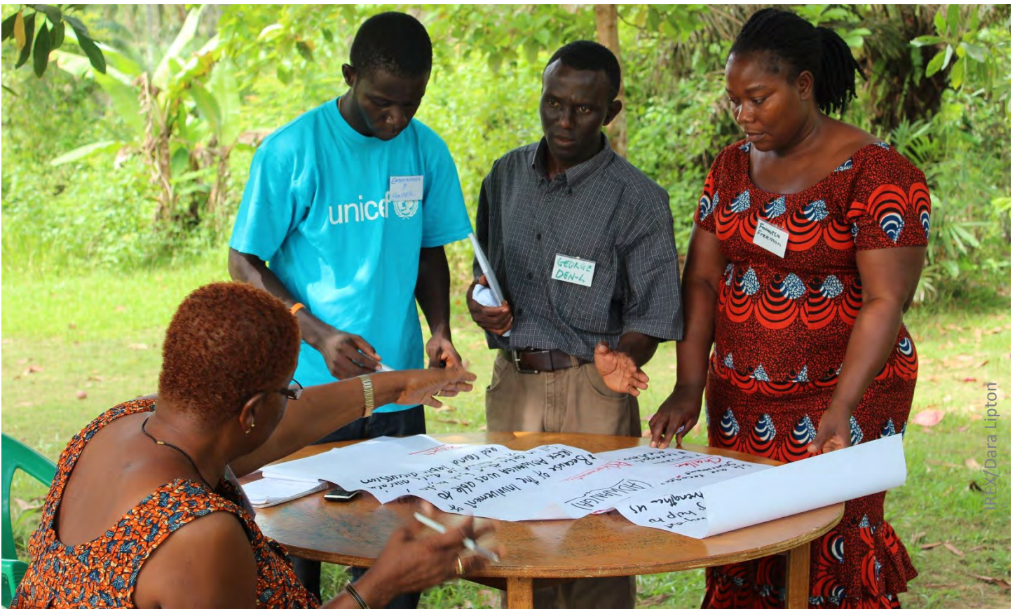
Staff members of Aiding Disadvantaged Women and Girls (ADWANGA), a CSO based in Nimba County, benefit from one-on-one training and mentoring led by their assigned Resource Partner

cerns over accountability of Ebola-related funding arose, IREX worked with USAID to re-focus efforts yet again on working with Liberian civil society and media to promote accountability of Ebola funds.