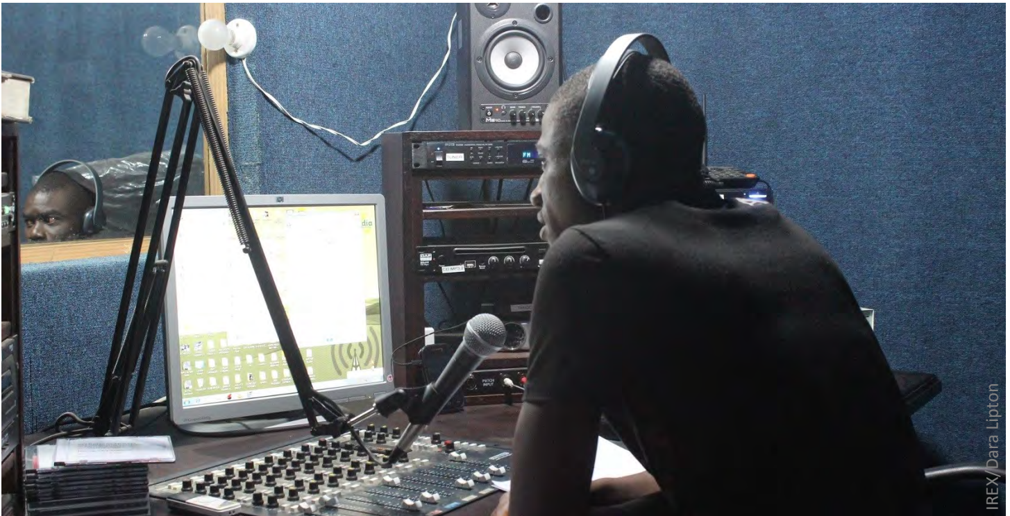
A radio host at Radio Bomi in Tubmanburg hosts a weekly program with disabled Bomi County residents. Through this type of programming, along with community outreach events such as the “I Know my Rights” and “Everybody’s Business” forums, Radio Bomi maintains strong ties with their listeners, thus increasing their own sustainability.

taining Liberia’s peace and contributing to the development of the country. The sector filled an important information void that existed during pre-war days when a vast majority of Liberians felt isolated and cut off from the governance process. Yet, radio stations faced major challenges in fulfilling their all important role. Among these challenges was the lack of resources—financial and otherwise—to sustain themselves, as addressed earlier in this report. Many stations also lacked the support of the community they served. Despite being community owned in theory, in practice many stations did not fully engage the inputs or voices of their listeners to increase the relevancy of their content, and community members were not engaged to inform management or fundraising decisions. The result was many stations