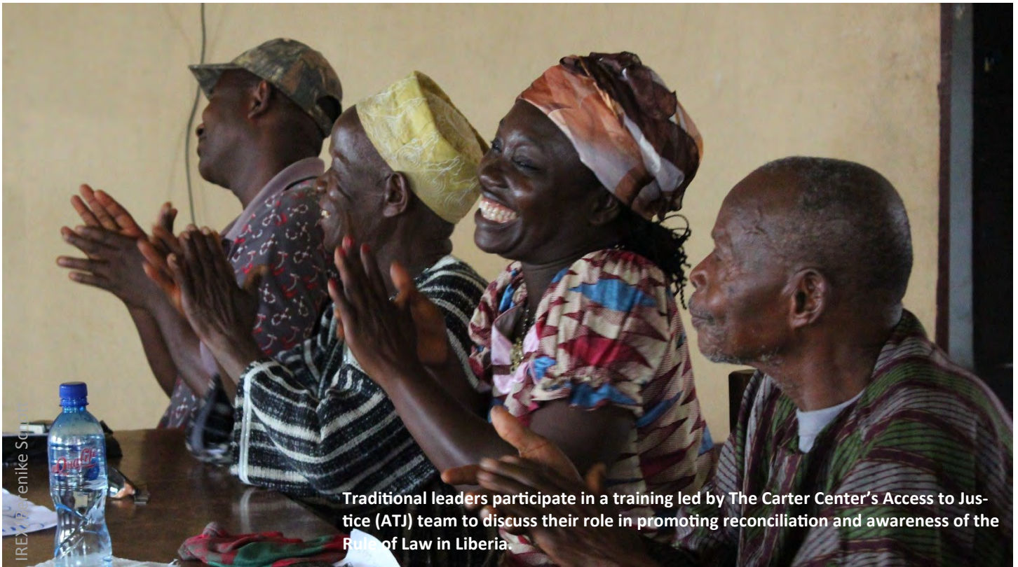
Traditional leaders participate in a training led by The Carter Center's Access to Justice (ATJ) team to discuss their role in promoting reconciliation and awareness of the Rule of Law in Liberia.

pute resolution capacity in rural communities, consistent with best practices and the rule of law. This work has been conducted since 2006 by TCC's Access to Justice Project and, since 2010, the project has worked directly with customary leaders, through the Ministry of Internal Affairs and with a range of funding. The main mechanisms to achieve the project goals have been education and dialogue on the rule of law, training in Alternative Dispute Resolution (ADR), and providing resources to address disputes and promote good governance and dispute resolution practices such as town hall meetings and local and national dispute interventions. This process of knowledge exchange and capacity building has been done at the national level working with the National Council of Chiefs and Elders of Liberia (NCCEL), paramount chiefs, and national women's leaders. At the clan and district-