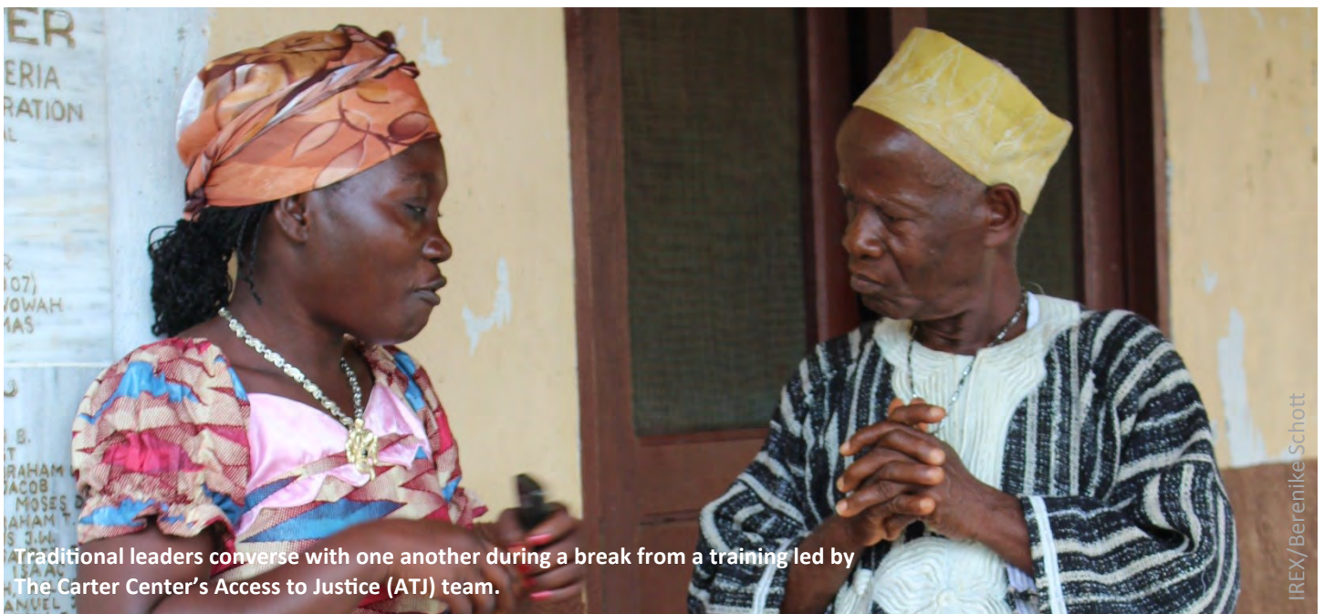
Traditional leaders converse with one another during a break from a training led by The Carter Center's Access to Justice (ATJ) team.

From the start of the project, the NCCEL took an increasingly formalized role in discussions of national importance. With support from The Carter Center including provision of training and logistical support the NCCEL has shown itself to be organizationally strong, particularly through its national chairman. The Government regularly approaches the NCCEL to resolve both cultural and political problems, including mediating between the Executive and the Legislature and between Christian and Mus-