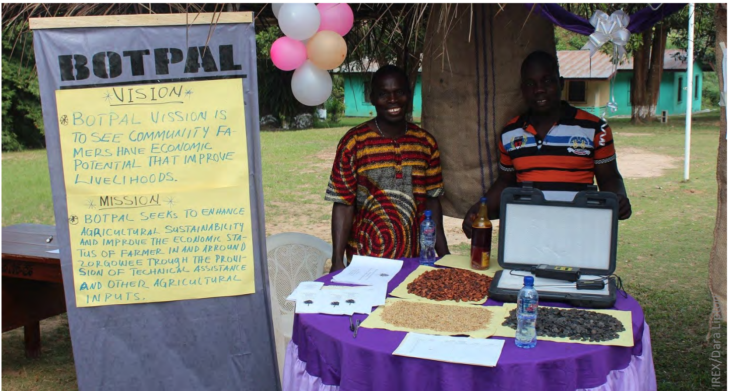
BOTPAL presents their business plan to visitors and judges who have come to attend the Social Enterprise Development competition in Gbarnga. After receiving extensive training and mentoring on SED, 17 organizations developed business plans and presented their ideas to a panel of judges, vying to win one of ten start-up grants. BOTPAL was one of the winners.