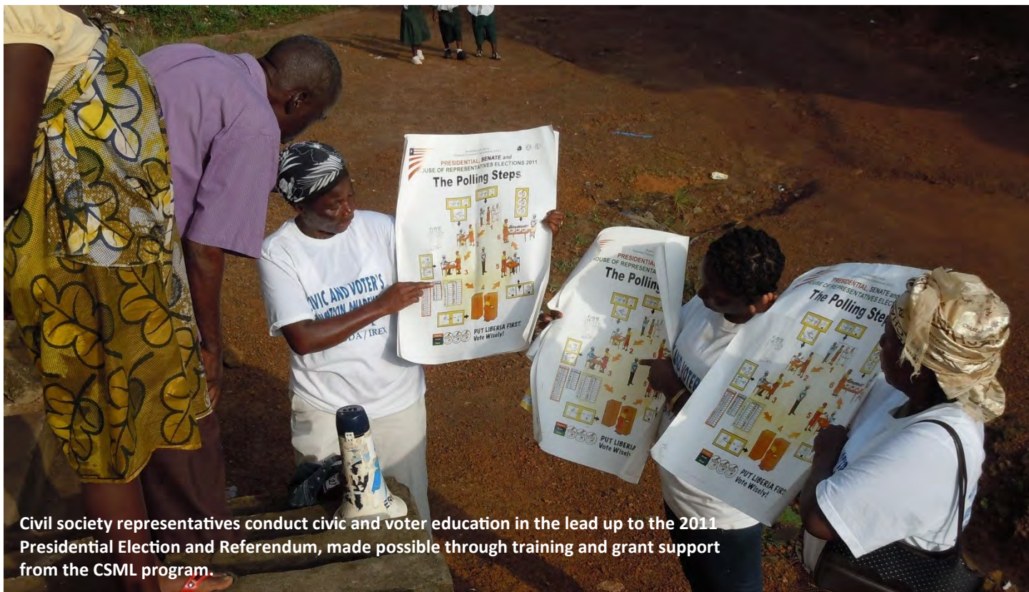
Civil society representatives conduct civic and voter education in the lead up to the 2011 Presidential Election and Referendum, made possible through training and grant support from the CSML program.

Though CSML’s program revision for a special election initiative in 2011 focused on media engagement, civil society had a very important role to play in ensuring citizens were prepared to vote. In a country where most voters neither read nor understand constitutional specifics and where poor roads make some areas inaccessible, the challenges were extraordinary. The first task was helping the voters understand the Referen-