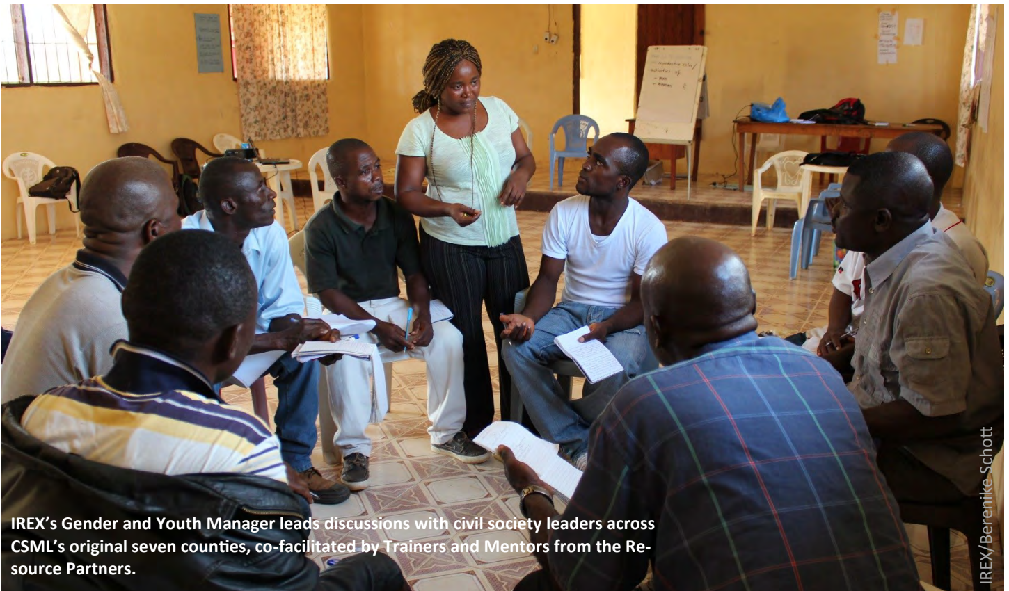
IREX’s Gender and Youth Manager leads discussions with civil society leaders across CSML’s original seven counties, co-facilitated by Trainers and Mentors from the Resource Partners.

Through the Women’s Media Initiative (WMI) led by LIWOMAC, CSML provided intensive training and mentoring to female journalists, engaged media managers to motivate increased support for female journalists, and created various platforms to increase women listenership of radio. In part due to these efforts, the number of women serving as professional journalists in Liberia increased by 2014 to 24% while women in management positions in the media increased to 15%. ■