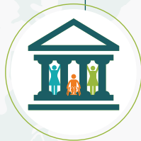
Career Development Centers Iraq